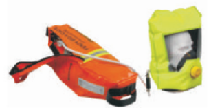
Emergency Escape Respirator