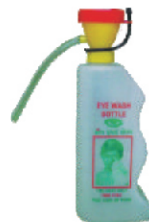
Eye Wash Bottle