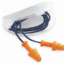
Reusable Ear Plug