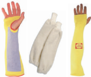
Kevlar / Cotton Arm Sleeves