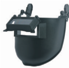
Welding Shield - Helmet Attachable