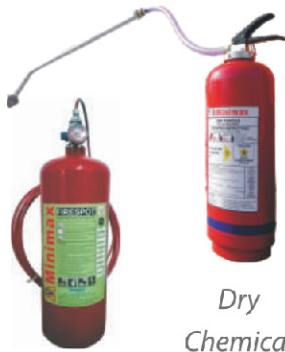
FIRESPOT Automatic Fire Extinguishers