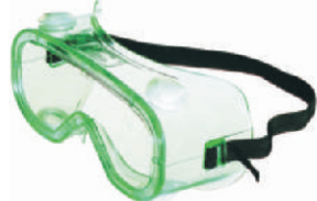
Clear Acetate - Chemical Splash