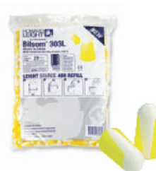
Uncorded Foam Ear Plug