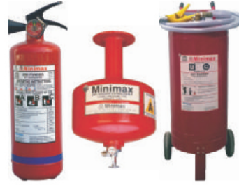
ABC Powder Based (Stored Pressure Portable Type, Trolley Mounted & Modular [Thermatic] Type)