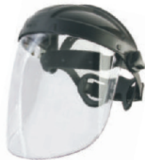
Clear Face shield

Visor Options: ▶ Clear ▶ Smoke Grey ▶ IR Shade 5 / Shade 8 ▶ Hi-Temp Gold Coated ▶ Wire Mesh