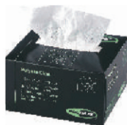
Lens Cleaning Solution & Tissues