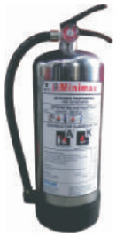
CLASS K (Specifically for Kitchen)