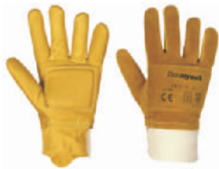
Anti Vibration Gloves