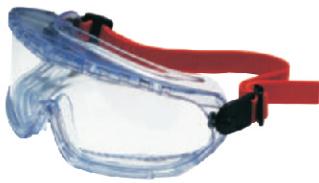
Clear - Chemical Splash