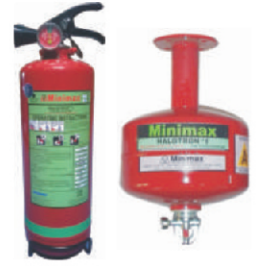
HALOTRON™ (Clean Agent) (Stored Pressure Portable & Modular [Thermatic] Type)