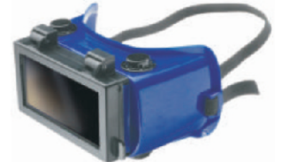
IR 11 - Welding Goggle