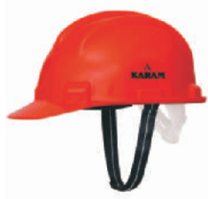
Karam PN 501/PN 521