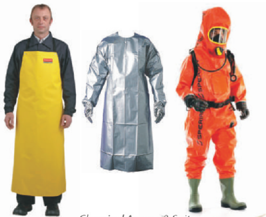
Chemical Aprons & Suits