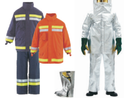
Nomex & Aluminized Fire Suits