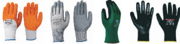
Seamless Knitted Gloves with Nitrile / PU / Latex Coating