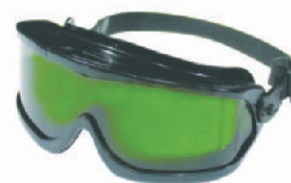
IR 5 - Welding Goggle