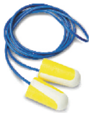
Corded Foam Ear Plug