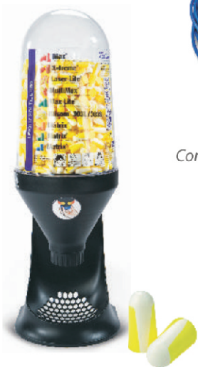
Ear Plug Dispenser

An extensive range of Disposable & Reusable (Corded / Uncorded) Ear Plugs, Banded Ear Plugs, Ear Muffs, Ear Plug Dispensers confirming to standards laid down by EN 352