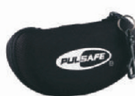
Goggle Case & Pouch