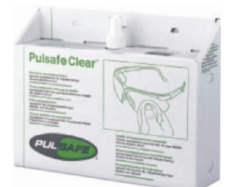
Disposable Lens Cleaning Station