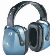
Clarity Ear Muff