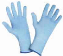
Cut Level 5 Gloves for Food Industry