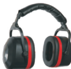
Ear Muff - High dB