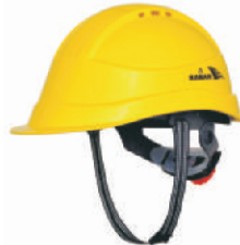
Karam PN 541/PN 542