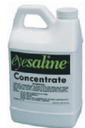
Portable Eye Wash & Eye Saline