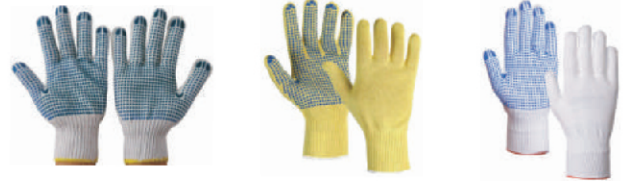
PVC Dotted Gloves: Cotton / Kevlar / Nylon