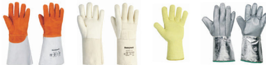
Heat Resistant Gloves up to 500°C: Leather / Cotton / Kevlar / Aluminized / Zetex