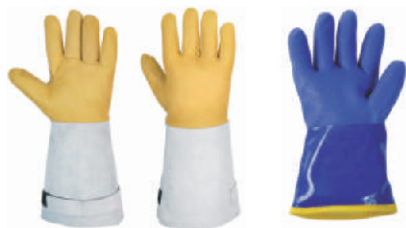
Cryogenic / Cold Resistant Gloves