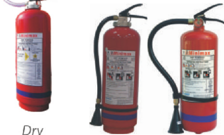
Dry Chemical Powder Cartridge Type (Class-D)