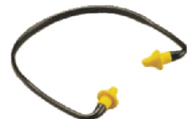
Banded Ear Plug