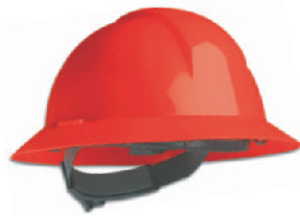
Full Brim Hat