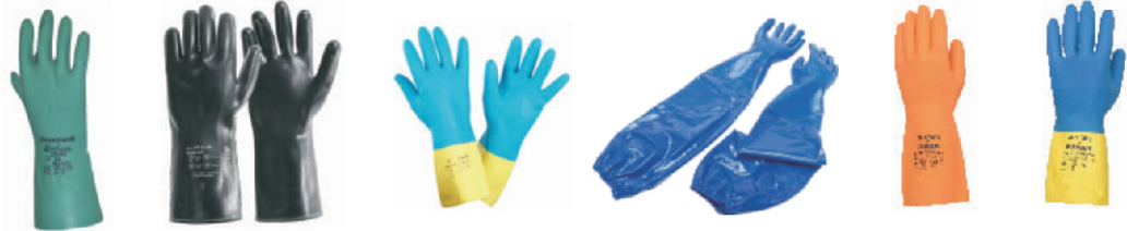
Chemical Resistant Gloves: Nitrile / Butyl / Neoprene / PVC