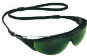
IR 3 Lens