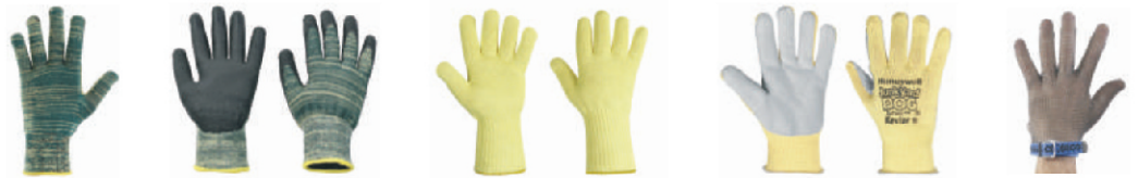
Cut Resistant Gloves upto Cut Level 5