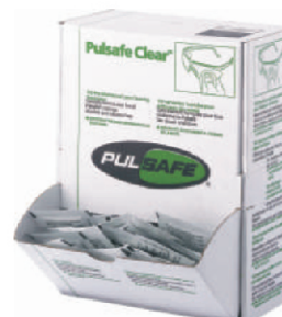
Lens Cleaning Towelette Dispenser