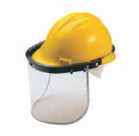
Clear Face Shield - Helmet Attachable