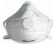
Disposable Respirators - With & Without Valve