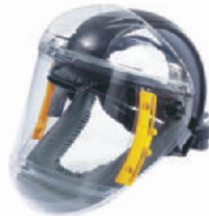
PAPR - Paintshop Mask