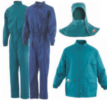
Flame Retardant Garment