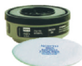
Full / Half Face Respirators - With cartridges & prefilters